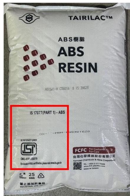
Original: packaging bag